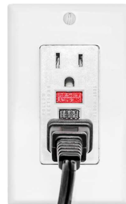
Figure-2: Typical GFCI Outlet

A GFCI (shown in Figure-2) is a circuit breaker device which is designed to protect people from hazardous shock or electrocution by shutting off an electric power circuit when it detects current flowing in a way that it is not meant to, such as through water or a person.