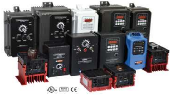
Figure-3: VFDs Available from KB Electronics

KB has had great success providing VFDs that work with GFCIs for numerous original equipment manufacturers (OEMs). KB offers a full range of motor controls (shown in Figure-3) which can be customized to work with GFCIs. Let KB Electronics provide a solution for you.